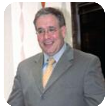
Manhattan Borough President Scott Stringer at Members Forum on July 14th.