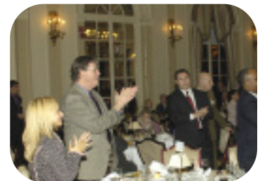
Standing ovations greeted speakers, the surprise speaker and the entire dinner committee.