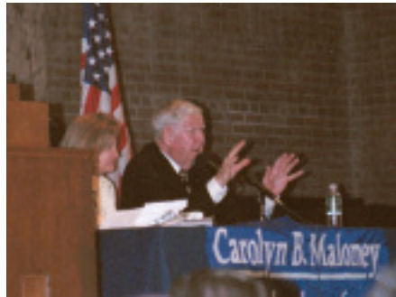
John Murtha explains his plan to redeploy troops from Iraq and reallocate the money for security at home

Congresswoman Carolyn Maloney arranged for Murtha's appearance and described Murtha as "a champion" for America's fighting men and woman. To the military families with members fighting in Iraq, Ms. Maloney said, "It's time for your sons and daughters to finally come home."