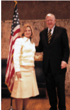
Carolyn Maloney presents fellow Member of Congress John Murtha

The invited guest was John Murtha, a Pennsylvania member of congress and a 37-year veteran of the Marine Corps. Murtha stunned the nation on November 17, 2005 when he called for an immediate withdrawal of U.S.