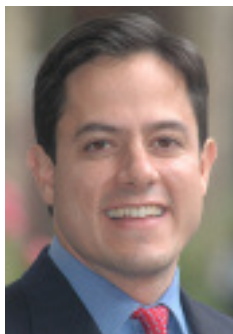
City Council Member Dan Garodnick

The Council recently held a hearing to determine if the M.T.A. had entered into contracts to effect the safety and security of mass transit.