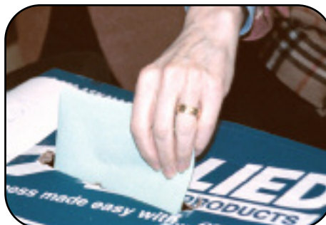
The Lex Club will only vote with verifiable paper ballots.